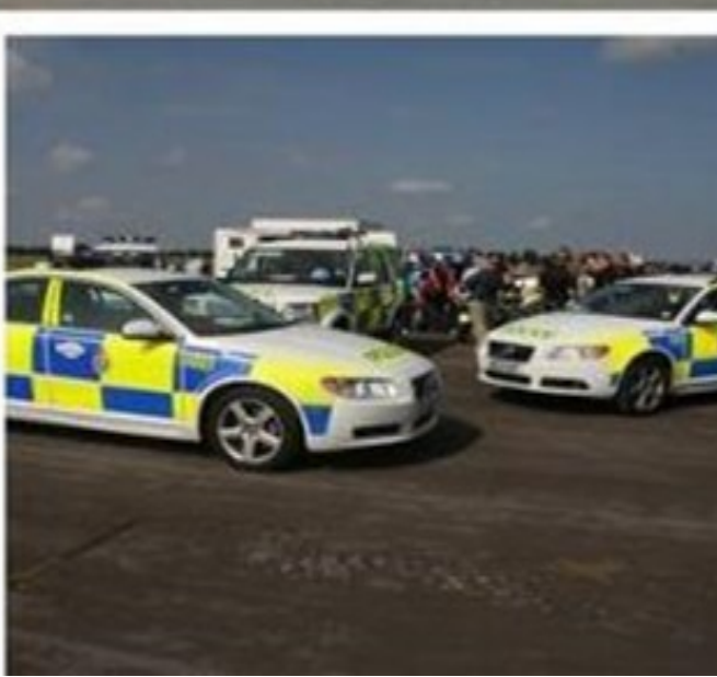
The Emergency Services Show 2018 @ Cotswold Airport

Cotswold Airport, Kemble,, Kemble,, Gloucestershire, GL7 6BA